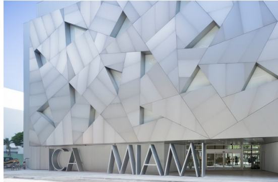
The new Institute of Contemporary Art building.

This summer, after 12 years of living in New York City, the allure of yearlong beach weather, nearby grandparents for our 2-year-old, and, frankly, the promise of affordable real estate finally convinced my husband and me it was time to relocate to Miami. It was a city where we both had roots but had never seriously considered as a place to live. After all, we were New Yorkers; we liked seasons, we braved the subway, we fell asleep to the sound of garbage trucks, we spent Sunday afternoons at a museum, and we watched indie movies at the Angelika. Sure, there was sunshine in Miami, and perhaps a house with a pool in the near future, but what about culture ? Miami, we knew, was not known for its culture.