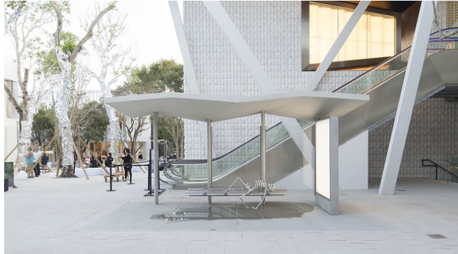
Urs Fischer's bus stop in Paradise Plaza.

Conveniently located next door to ICA Miami is the also free-of-charge private De la Cruz Collection , and a few more blocks away, the Rubell Family Collection , which, with its impressive number of Basquiats, Harings, Koonses, and Kusamas, is one of the world's largest privately owned contemporary art collections. "We are built into a walkable district," Salpeter added. "The hope is people do a little shopping, have a coffee across the street, and then wander into our building and see some art."